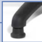
Glides for use where no movement is required