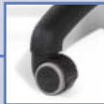
Soft tyred castors for hard floor surfaces